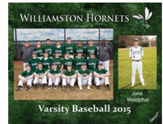
8x10 Memory Mate