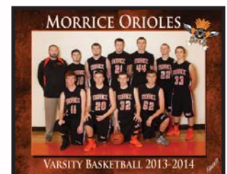
8x10 Team Picture